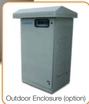
Outdoor Enclosure (option)