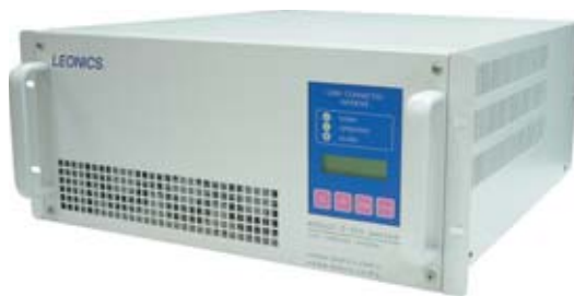
Rack mount case