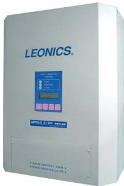
Wall mount case